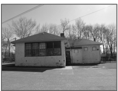
Ridgeley Rosenwald School (75A-028)